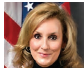
REP. ALLISON TANT District 9, Florida Legislature