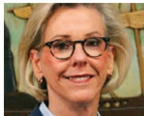
THE HONORABLE JANE CASTOR Mayor, City of Tampa